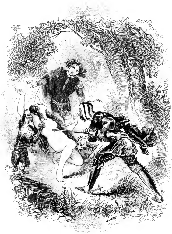
THE WIFE OF THE WARRIOR OF ORCEL, HOWEY